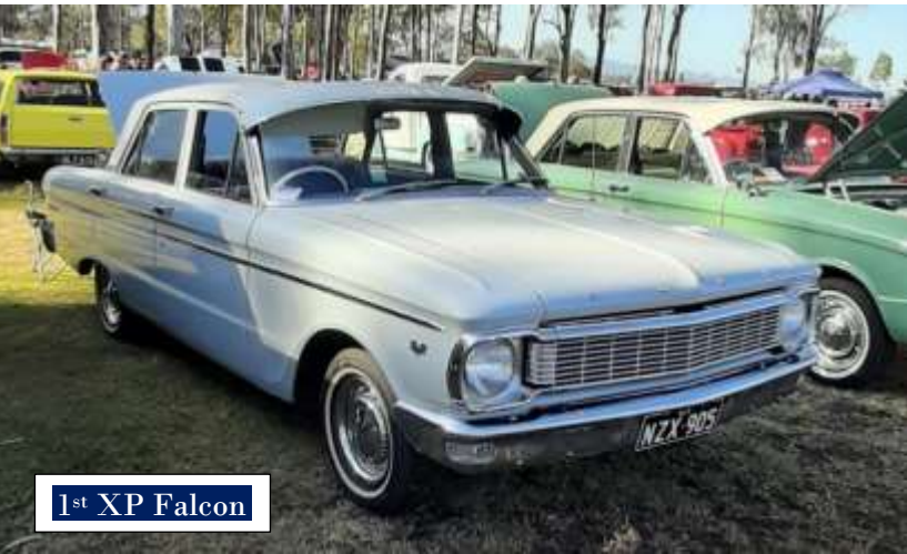
1 st XP Falcon