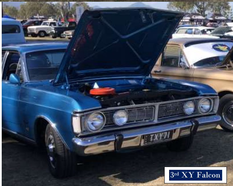
3 rd XY Falcon