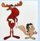
Page 3 Top left Rocky & Bullwinkle